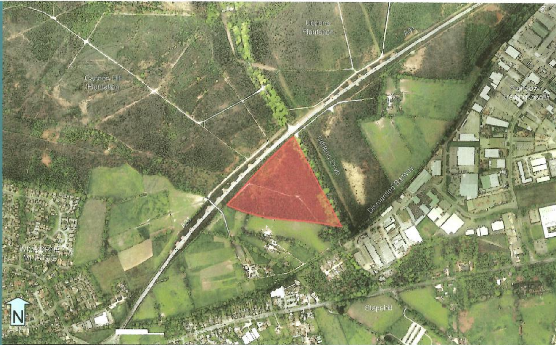
2005 Aerial Photograph