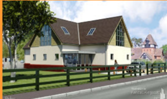
Artist's impression of the new building

The Reef deserves your support. A website has been set up so that you can make donations on-line and get further information on events. If you are a UK tax payer the charity can claim back the tax through Gift Aid. Please go to www.virginmoneygiving.com and enter 'Colehill' or 'Reef' in the charity search.