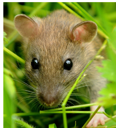
Wasn't me - I wasn't there!