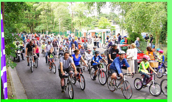
and they're off, only 25 miles to go......

and enter "Colehill" or "Reef". If you are a UK tax payer, please complete the gift-aid form.