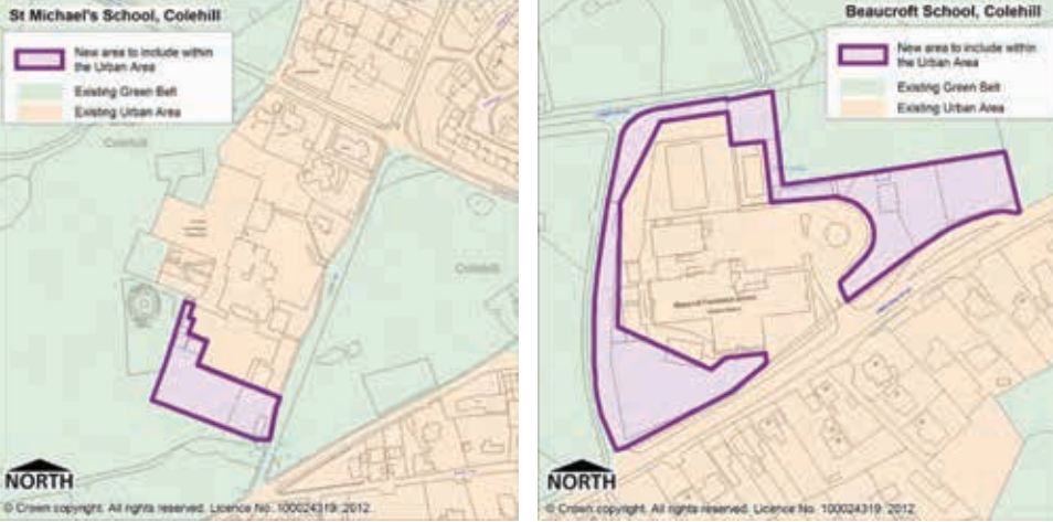
Proposed Green Belt Boundary Amendment, St Michael's School, Colehill (Map 8.2 - CS page 86)

Education - The development planned for the Cranborne Road will have a new school. This is not an additional school, it is a replacement school for Wimborne First School which is at capacity. The new school should deliver an additional 100 places but these will soon be filled as residents move in to the New Neighbourhood. Traffic movements will almost certainly increase at peak times because a significant number of children that currently walk to school will be delivered and collected by car as the distance for some of the younger pupils will simply be too far for them to walk. The Parish Council raised these issues on numerous occasions, including serious concerns about road safety. Colehill could also be faced with the closure of Hayeswood School with a replacement school being built on the south side of the Leigh Road on the New Neighbourhood site. Parents will be faced with crossing the extremely busy Leigh Road to drop children at school; many will resort to using their cars because of the safety concerns. The provision of a footbridge or underpass has been raised by Colehill Parish Council on many occasions but no guarantees have been given that this crucial safety feature will be provided.