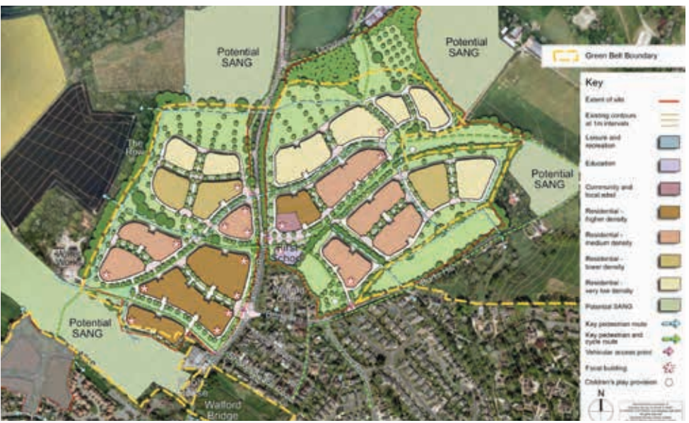
Cranborne Road New Neighbourhood, Wimborne (Map 8.7 - CS page 95)