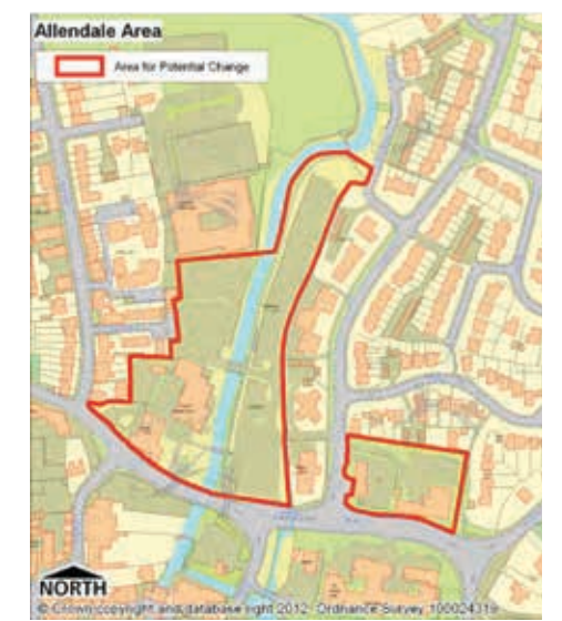
Wimborne Minster Town Centre (Map 8.1 - CS page 85)