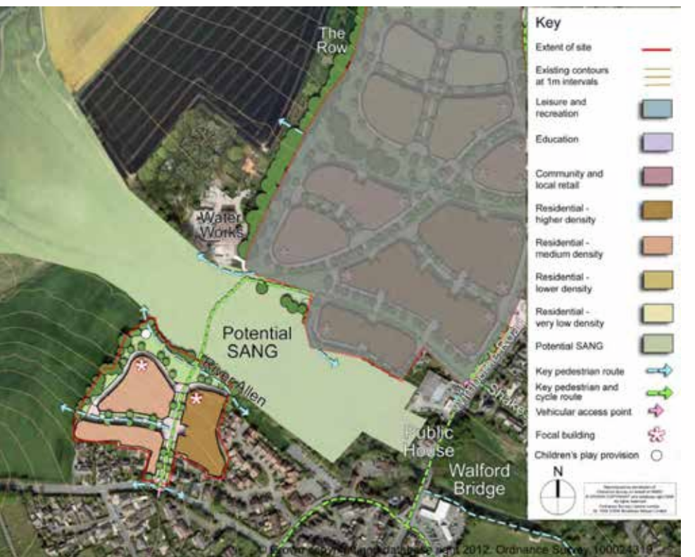
Stone Lane New Neighbourhood, Wimborne (Map 8.6 - page 93)

Employment - Employment is another area of considerable anxiety to all on the working party. Stone Lane Industrial Estate which currently provides lucrative employment for many thriving small businesses will be demolished to make way for additional housing. There are no plans within the CS to provide well paid, skilled jobs within Colehill and Wimborne resulting in all those of working age moving into these New Neighbourhoods having to commute out of town to their place of work. The development on the Cranborne Road is of particular concern as it is the "wrong" side of town and roads through Colehill could become rat-runs for those needing access to the A31. This could mean an unacceptable increase in traffic at peak times and could result in significant safety issues for the hundreds of children that attend the 6 schools within the parish.