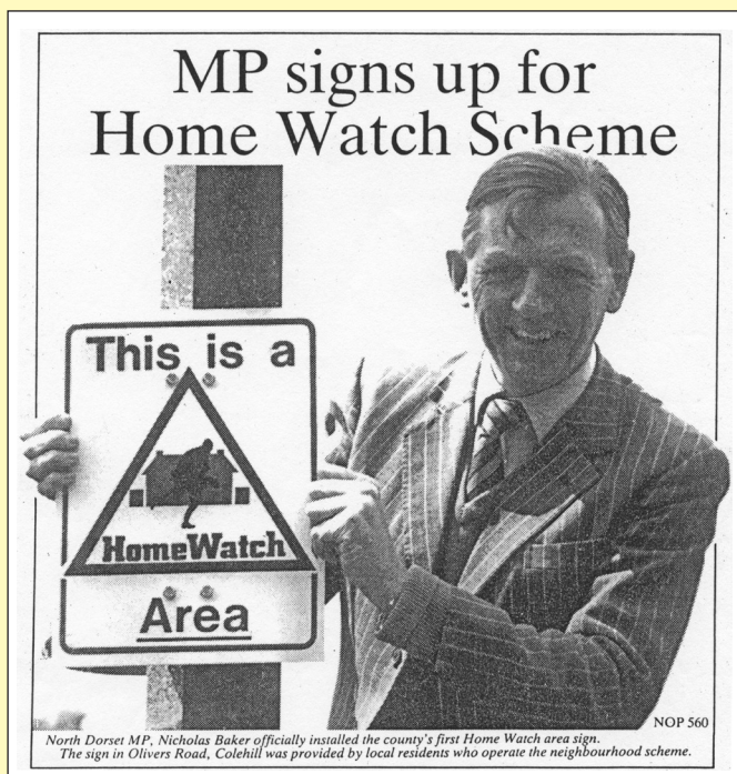
1989 - Reported in the Avon Advertiser