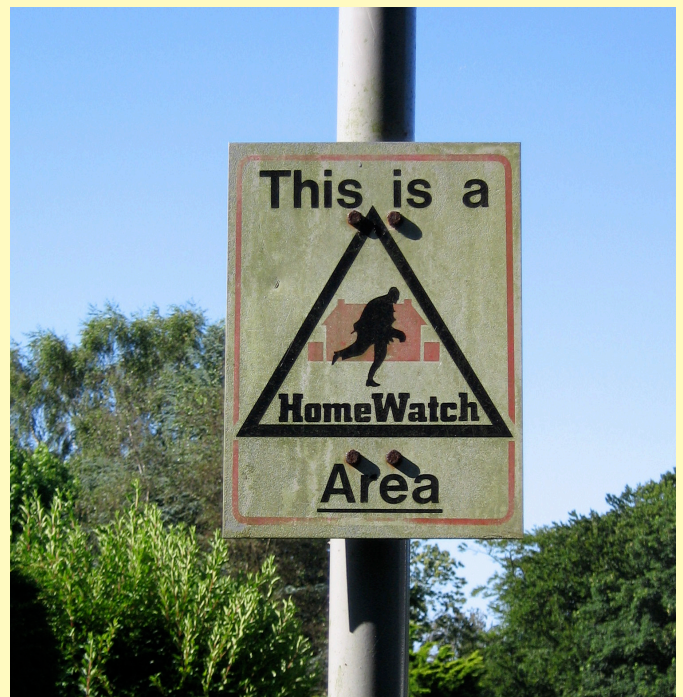
2012 - The same sign (on a replacement lamppost!)