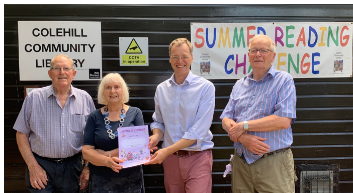
Our MP Michael Tomlinson visited on Tuesday 13th August to hear about the Challenge

The Space Chase Summer Reading Challenge 2019 is drawing to a close and we are delighted that so many young people have shared their excellent book choices with us. If all those who have signed up this year complete their Challenge we will have chatted about approximately 1000 books! Most of these borrowed from our library.