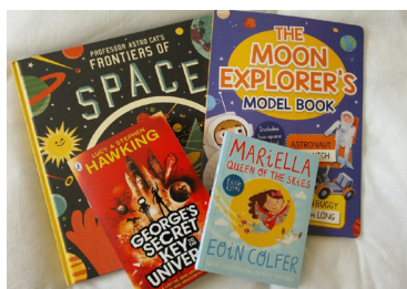
Win one of these books in our free prize draw

It is not too late to complete the Challenge so don't miss out on the chance to be entered for the free prize draw for all those telling us about their six books at Colehill. This year there are four opportunities to win!