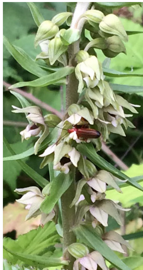
Flower spike with soldier beetle carrying pollinia. Epipactis helleborine (L.) Crantz (Broad-leaved Helleborine)