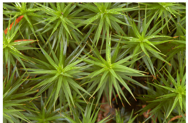
Common Haircap moss, Polytrichum commune

In contrast, Cypress-leaved Plait-moss, another common moss partly climbing up a trunk nearby, weaves a mat so green and shiny and smooth that it forms a soft mattress for any passing elf needing a snooze. A third species I spotted, Common Haircap, is one I've been looking out for this winter. This moss is particularly good at forming dark green star patterns that look too neat and perfectly repetitive to be a living plant growing in such haphazard conditions.