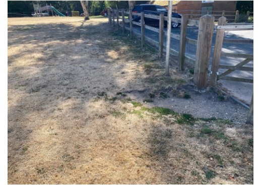
View from car park gate