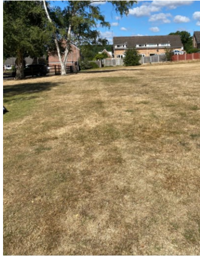
View from playground to tree