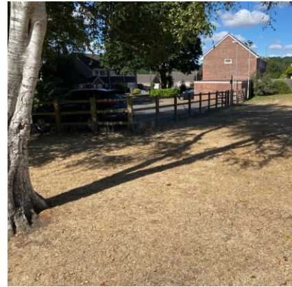
View from tree to car park