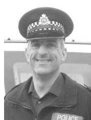
PC 1503 Ian Curtis